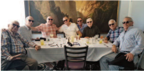
Brunch at Tropics On The Drive

The Manor House has both indoor and outdoor areas for the cocktails and full buffet. We enjoyed beautiful weather for the event as well. The event raised about $40,000 for the Foundation. Fortunately the timing for the event occurred before the beginning of the Covid-19 shutdown and everyone enjoyed the casual evening.